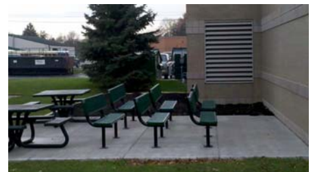
Our outdoor learning space!

flowers, shrubs, trees, etc. Our hope is to create a natural habitat for plants, animals, and insects related to what we are learning in our 'regular' classrooms.