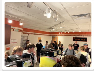
Tigers Den is open!