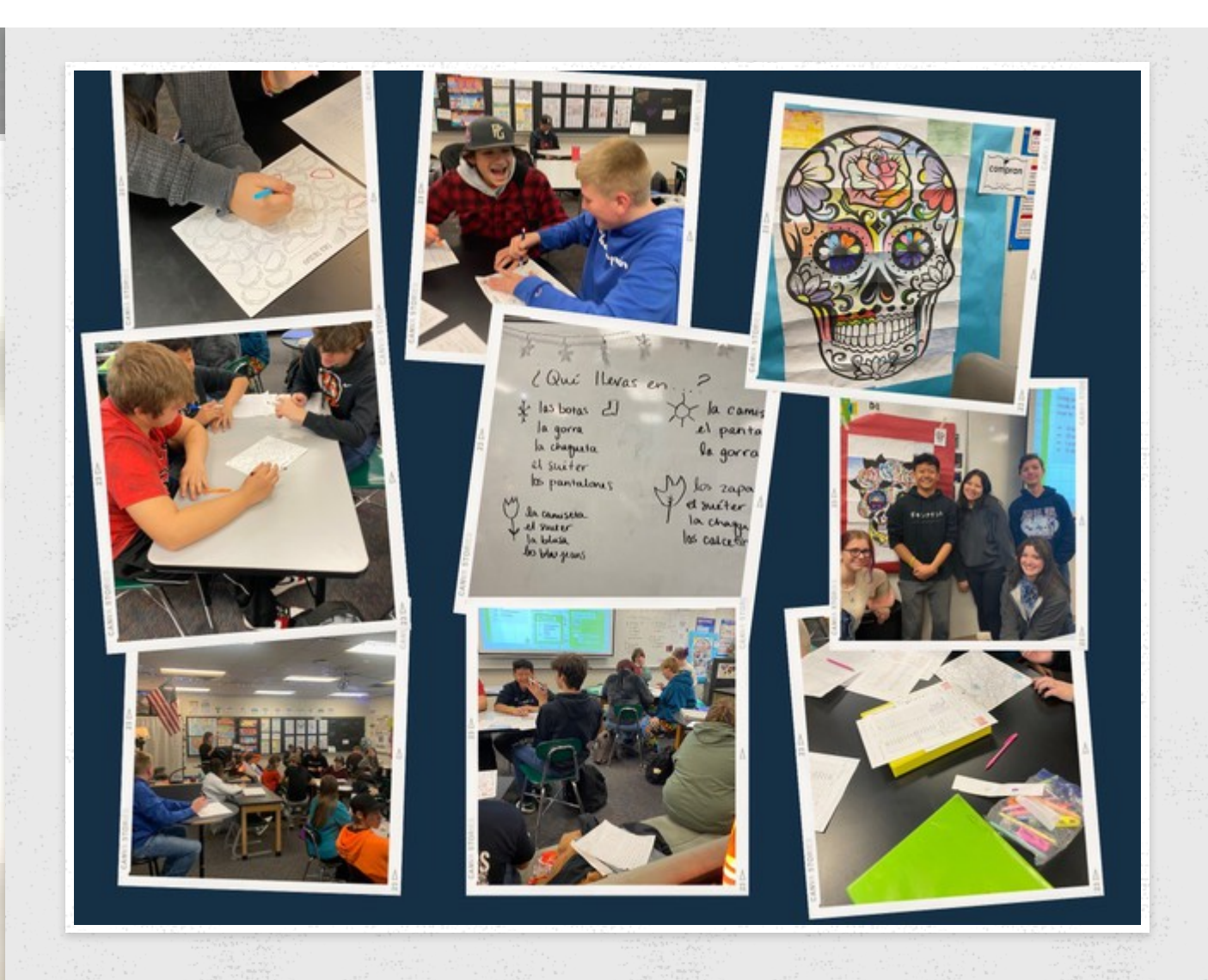
TIGER TALENT SHINES