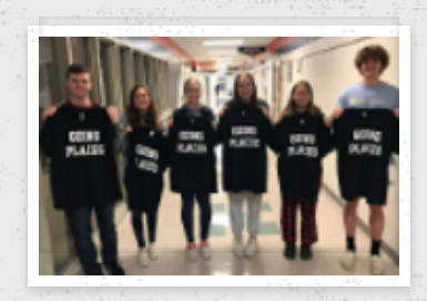
LOOK AT US!